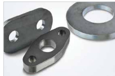
Excellent cutting quality

Better cutting quality means less post-processing, which helps you to save manufacturing costs. A proper technology is available for each cutting task: in addition to plasma, the PL Compact can be equipped also with an oxyfuel cutting head.