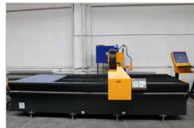
Compact design and low space requirement

Space is costly so we designed the PL Compact as a compact stand-alone solution. Less space needed for control consoles, cabling and media supplies gives you more space for your work.