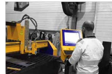
Plug & play installation

Thanks to the plug & play installation concept, the system is installed and ready for operation in a short time. A dedicated carrier system under the cutting table allows the machine to be easily unloaded with a forklift.