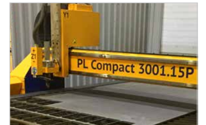
Cutting table options

Depending on your requirements, different cutting table designs are available for the PL Compact series – from a simple water bed to highly efficient fume extraction tables.