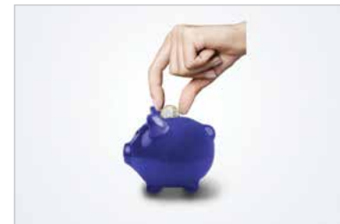
Cost-saving operation and maintenance

Cost savings are key – in comparison with laser systems, modern plasma cutting machines impress with their high cutting speeds and excellent cutting quality at substantially lower costs.