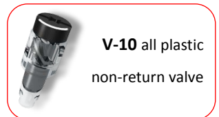
V-10 all plastic non-return valve